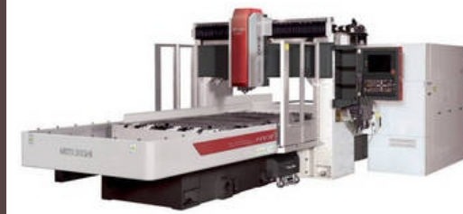
MITSUBISHI LESER M/C. (2KW)