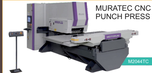
MURATEC CNC PUNCH PRESS