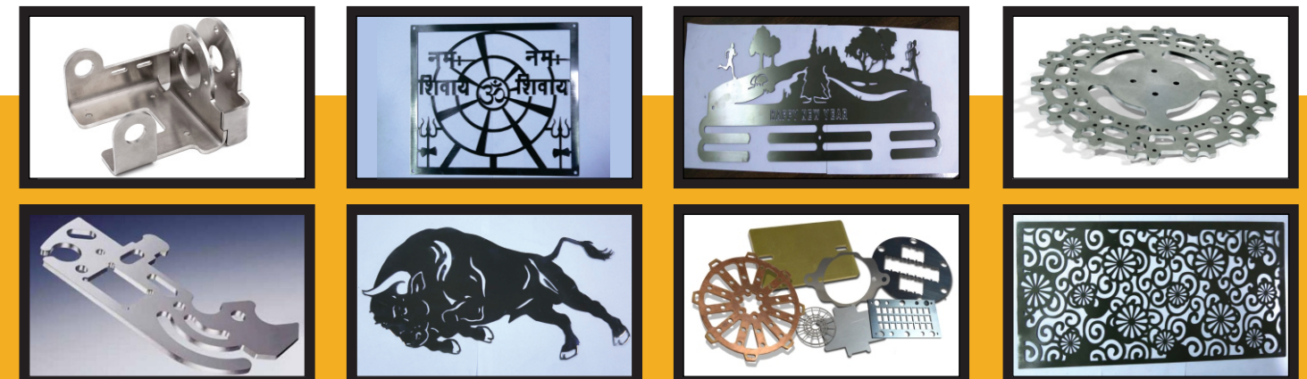
● Our Laser Cutting Sample ●