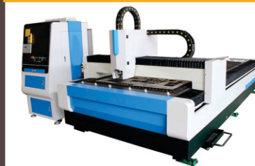
YAWEL LASER M/C. (700W)