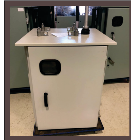
Our Fabricated Sample